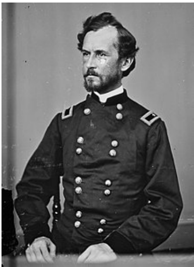
Gen. Manning Force

A contract was entered into with the City of Sandusky deeding approximately 99 acres to the State. The city agreed to build water and gas mains, lines for electricity, street car tracks to the home site and to furnish an ample supply of water at a cost of $25.00 per year for 13 years, after which time the home would be charged the standard rate for industries in Sandusky.