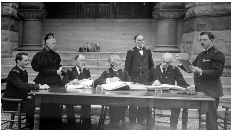
The First Officers of the Ohio Soldiers and Sailors Home

Two levels of care are offered at the homes: standard care for those veterans in need of any intermediate level of care, and special care for veterans with Alzheimer's disease and other types of dementia. Most residents receive a pension and benefits of some type—Social Security, disability, VA or other retirement subsidy. To supplement their regular monthly income, many residents are employed by OVH as resident workers. The Ohio Veterans Homes are funded by the State and also receive a per diem rate from the Department of Veterans Affairs for each resident. The resident pays an income-based assessment. This money is deposited in the Resident Benefit Fund. A small percentage of residents do not have any income at all. They are not subject to the assessment fee and local service organizations donate funds to enable them to purchase sundry items for their personal use.