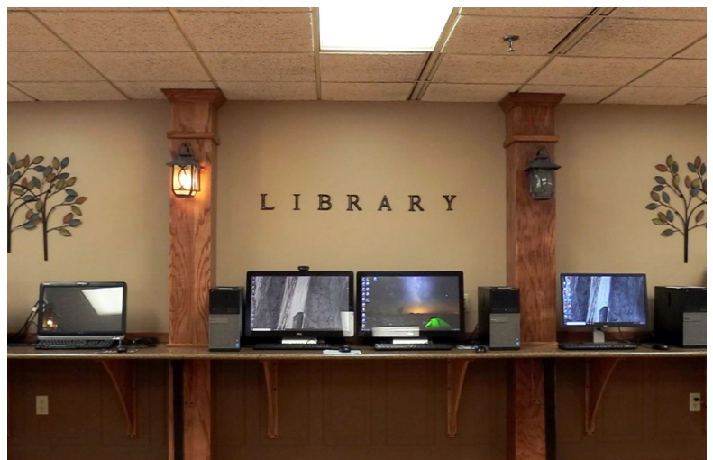
The Library at OVH Sandusky, with New Computers, Circa 2018

The Admissions Office processes applications beginning with the initial mailing of information and concluding with the scheduling of an admission date.