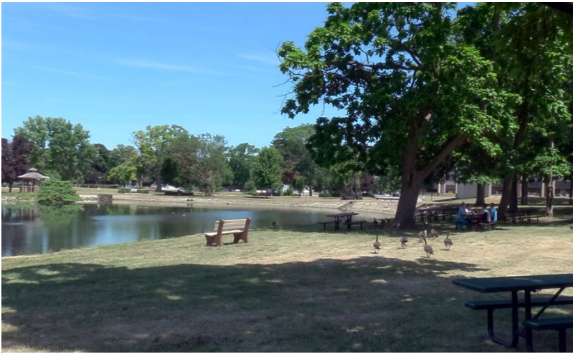
OVH Nursing Staff Enjoy a Picnic Lunch near the Veterans Pavilion

Each spring, the residents eagerly anticipate the re-opening of the Veterans Pavilion with its series of picnics and other outdoor festivities. Over $225,000 was raised through donations by social, fraternal and veterans groups and other caring individuals to erect a pavilion in the scenic Mack Pond area. It was dedicated in June, 1984, and rapidly became a favorite gathering place for residents and local citizens. Reserved use of the facility for weddings, graduations, picnics, etc.